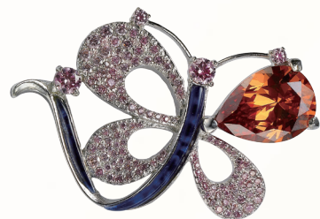
DJB - 4