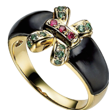
DJR - 2021