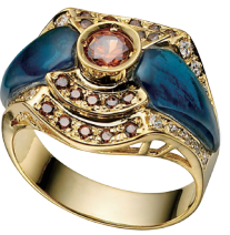
EAR - 2004