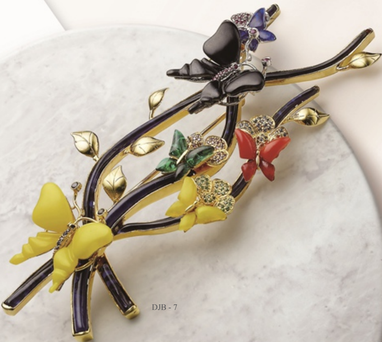
DJB - 7

A GEM THAT SHINES WITH HIGH QUALITY AND PROFOUND FEELING. THE MINERITE STONE WHICH CARRIES THE COLOR OF NATURE. TELLS YOU DIGNITY IN YOUR HEART.