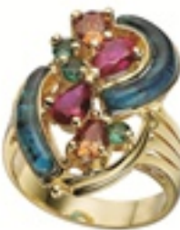
EAR - 2016