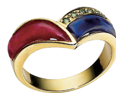
DJR - 2023