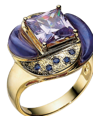
DJR - 2019