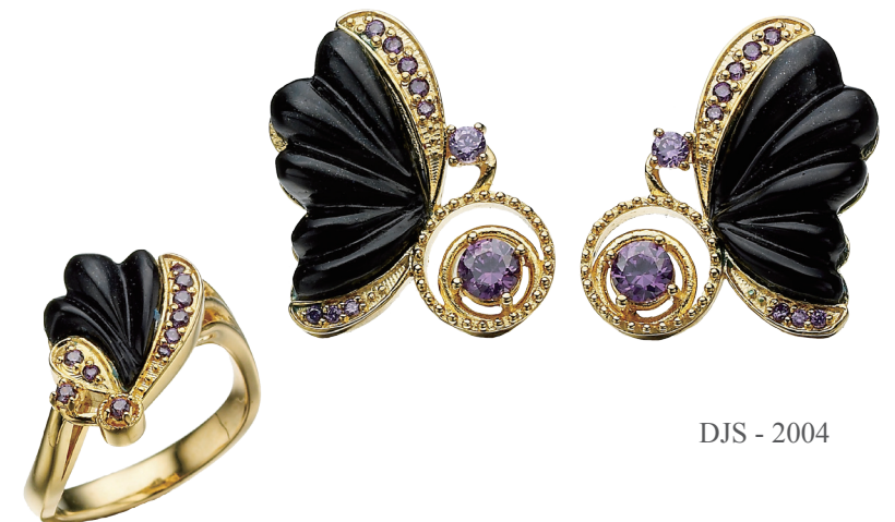
DJS - 2004