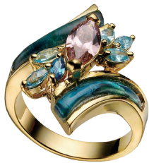
EAR - 2001