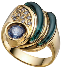
EAR - 2005