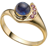
EAR - 2006