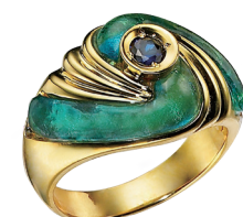
DJR - 2028