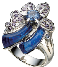
EAR - 2010