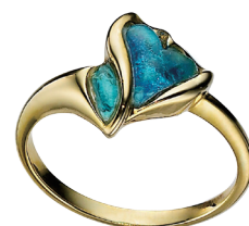
DJR - 2029