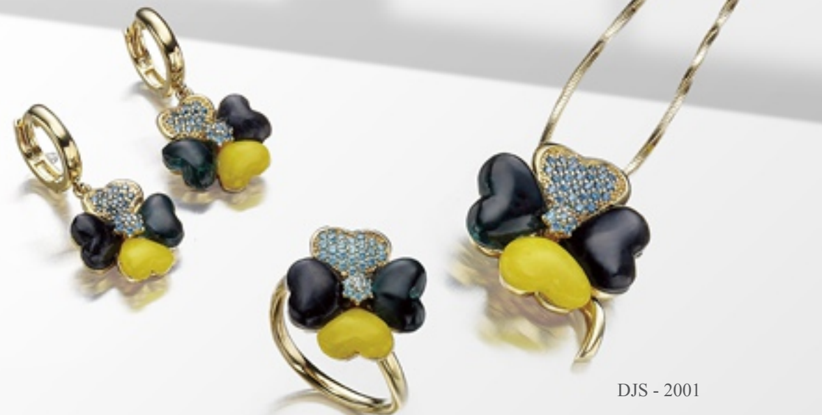
DJS - 2001