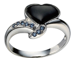
DJR - 1098