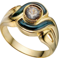
EAR - 2007