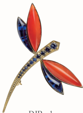
DJB - 1