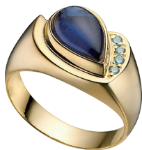
EAR - 2009