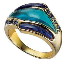
DJR - 2014