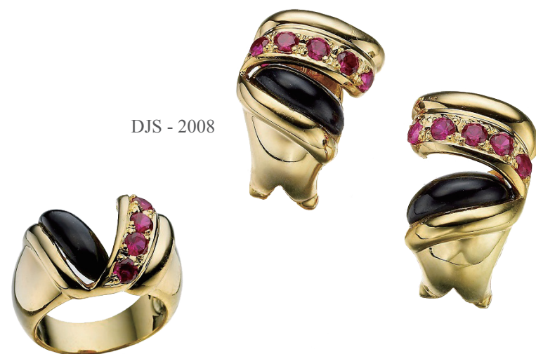
DJS - 2008

Elegant space where other people's eyes are focused a woman of dignity and intelligence. In the midst of dignity, shining jewels.