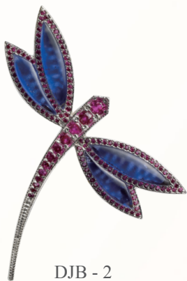
DJB - 2