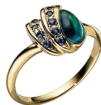
DJR - 1099