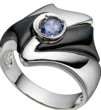
EAR - 2011