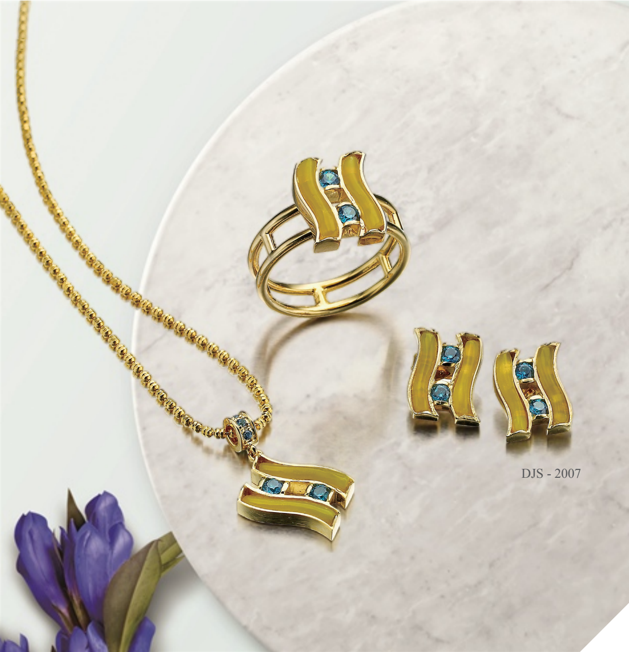
DJS - 2007