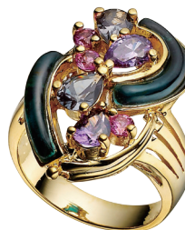
EAR - 2013