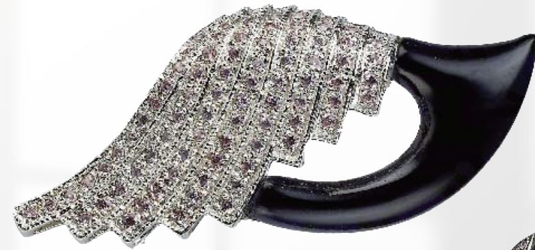
EAS - 2017

BLACK STONE & DIAMOND. THE BEAUTIFUL LIGHT OF MINERITE MAKES YOU STAND OUT LIKE A QUEEN.