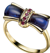
DJR - 2027