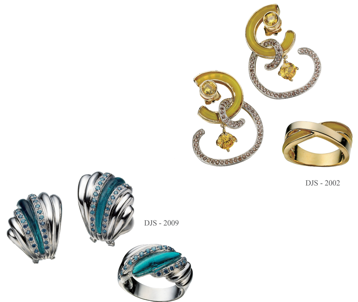
DJS - 2002