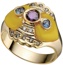
EAR - 2002