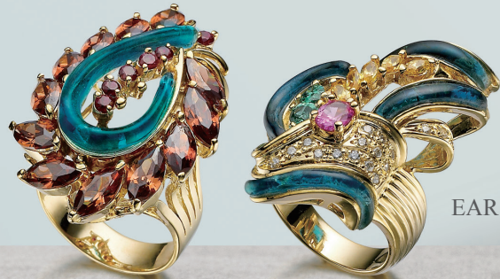
EAR - 2014 / EAR - 2015

THE LIGHT OF THE BEAUTIFUL MINERITE STONE MAKES HER ELEGANCE EVEN BRIGHTER. A HARMONY OF NATURE'S BRILLIANT LIGHT AND LUXURIOUS DESIGN.