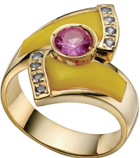
EAR - 2003