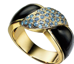
DJR - 2031