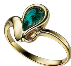
DJR - 2032