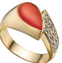
EAR - 2008