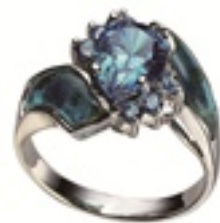
DJR - 2011