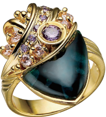
EAR - 2012