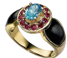
DJR - 2017