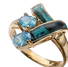
DJR - 2033

Beauty with Nature A mild yet luxurious harmony She falls into it.