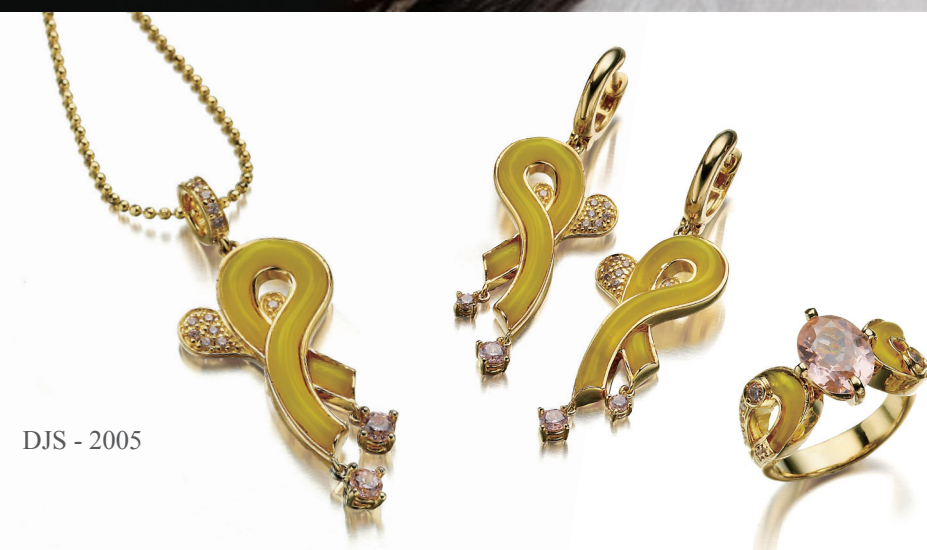
DJS - 2005