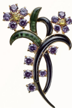
DJB - 3