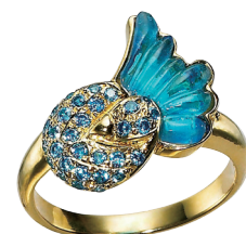
DJR - 2020