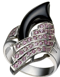
EAR - 2017